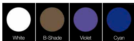
Under natural light conditions

LITE ART paste stains have a fluorescence quite similar to natural teeth. Their natural effect persists even under artificial light conditions.