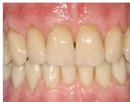
Upper teeth 13-23 and the gingiva are individualised with LITE ART and Ceramage