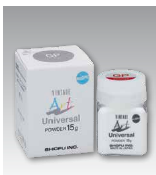
Glazing Powder GP 15 g - PN P0691 50 g - PN P0692