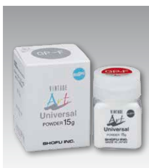
Glazing Powder GP-F 15 g - PN P0693 50 g - PN P0694