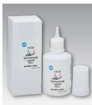
Vintage Art Universal Liquid 50 ml - PN P0695