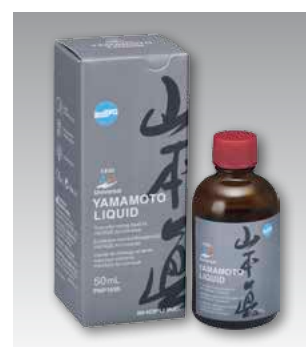
Yamamoto Liquid 50 ml, with pipette PN P1695