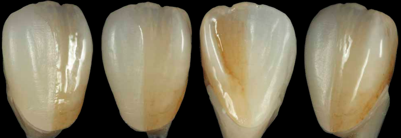
Stained and glazed monolithic zirconia restorations, made by dental technician Tomoyuki Edakawa, Japan

Vintage Art Universal can be applied in very thin layers and provides you with a simple and complete system: easy to use, ensuring highly aesthetic results, and virtually limitlessly expanding your range of creative options – no matter whether you are an ambitious beginner or an experienced professional.